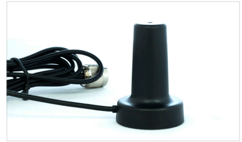
Image does not reflect the actual size of the antenna

Ordering Part #: 100-00044-01 (TNC) Ordering Part #: 100-00044-02 (SMA) Ordering Part #: 100-00044-03 (SMB) Ordering Part #: 100-00044-04 (MCX)